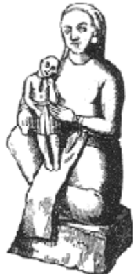
Catholic image or Pagan Babylonian image?

Although difficult reading, this book accurately provides a fascinating historical in-depth examination of the shocking similarities between the practices of ancient Babylonian religion and those of today's Roman Catholic church.